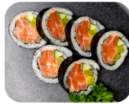
60. Seared salmon