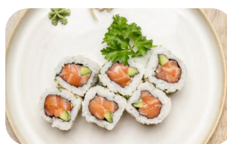
68. Spicy Salmon