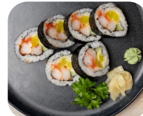
65. Tiger prawn