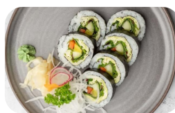
69. Vege maki