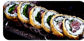
61. Crispy Tuna