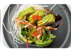
120. Spider maki