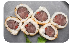
62. Spicy Tuna