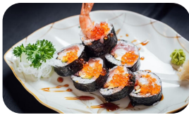
63. Ebi Tempura